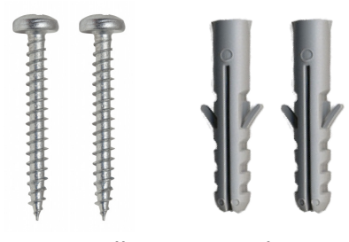
Wall Screws and Plugs Supplied